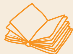
A reading workshop